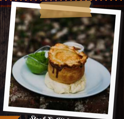
Steak & Kidney Pie