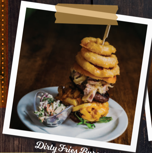
Dirty Fries Burger